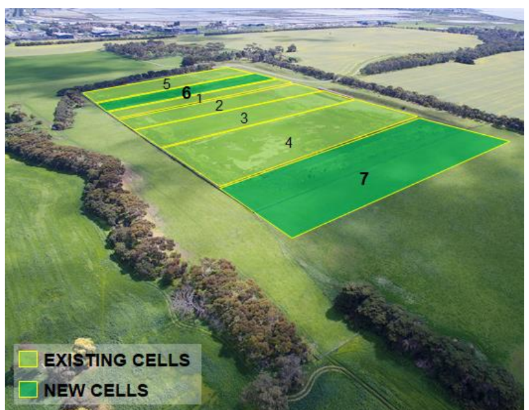
Top image: Aerial photograph with graphic overlay demonstrating three existing landfills at Point Henry. Bottom image: Aerial photograph with graphic overlay showing existing and proposed new containment cells at the Moolap Landfill site.