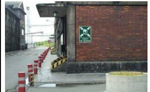
Meeting Point in Electrodes Department