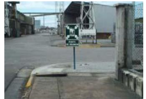
Meeting Point in Casthouse Department