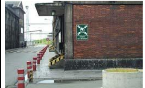
Meeting Point in Electrodes Department