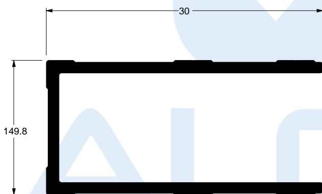
CA-354 26,270 kg/m União fueiro-barrote