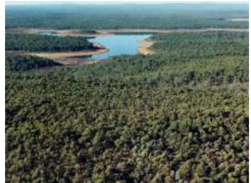
The same pit 20 years after mining and rehabilitation has taken place (2001)