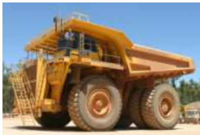
190t Haul Truck

Alcoa mines bauxite in the Darling Ranges at two mines. Alumina is extracted from bauxite at three WA refineries. Most alumina gets turned into aluminium by a process called smelting. Aluminium is unique as it is endlessly recyclable.