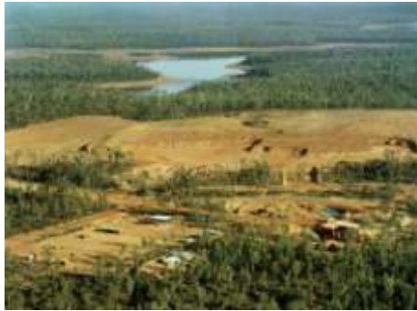
A bauxite mine pit (1980)

Which was the most difficult step in the Choc Chip Mining process?